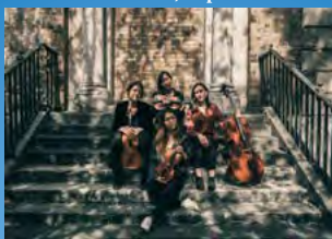
KLEIO STRING QUARTET

Thursday 7th March 2024 | 19.45 Christ Church, Hope Street