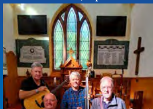
LONGWAY BLUEGRASS BAND

Saturday 25th November 2023 | 19.45 Christ Church, Hope Street