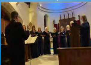
THE CANTABILE ENSEMBLE

Friday 17th May 2024 | 19.45 Christ Church, Hope Street